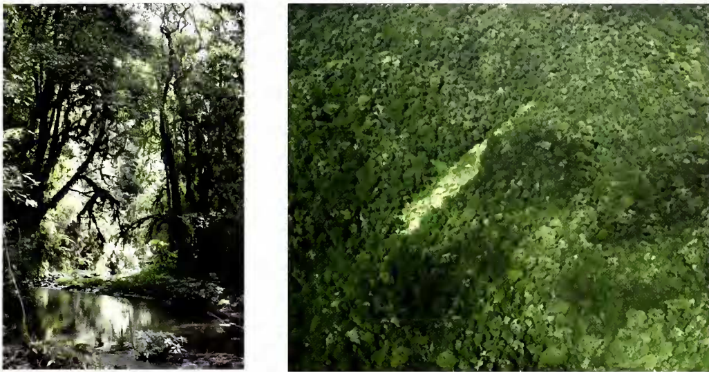
Fig. 2. Left – Type locality of Rhinolophus willardi . Note large amount of epiphytes on trees near Kilicha River. Right – Aerial view of artisanal mining site within forest of Misotschi-Kabogo highlands.

Type locality. Misotschi-Kabogo highlands, north of Kalemie, Kilicha River, above the western shore of Lake Tanganyika, South Kivu Province, eastern Democratic Republic of Congo, 5°06'19"S, 29°03'56"E, 1880 m. The holotype was captured in a clearing near a stream in a deep valley (Fig. 2, left). The forest covering the surrounding slopes was dense with tall trees (40–50 m) covering the surrounding slopes and had a fairly open understorey. The clearing was formed in an area where the stream had deposited gravel in the wet season but was at a much lower level at the time of capture (dry season).